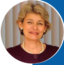
H.E. Irina Georgieva Bokova