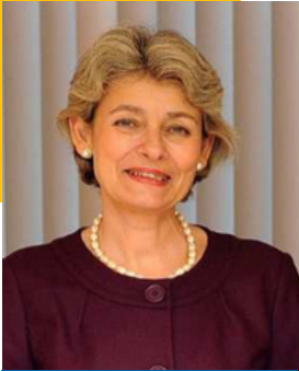
H.E. Irina Georgieva Bokova

10th Director-General of UNESCO Honorary International Dean, G.S. of Global Maestro Human Management